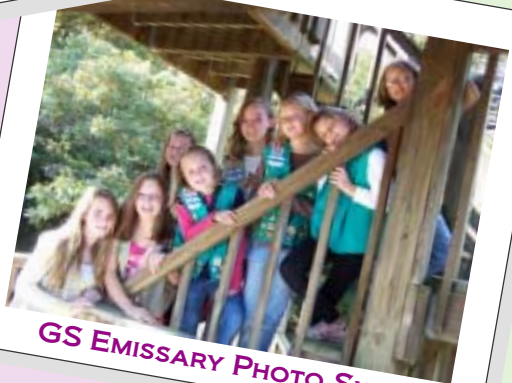
GS EMISSARY PHOTO SHOOT