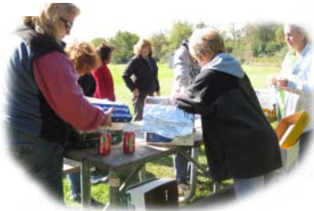
Making Ovens & Stoves