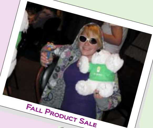
FALL PRODUCT SALE