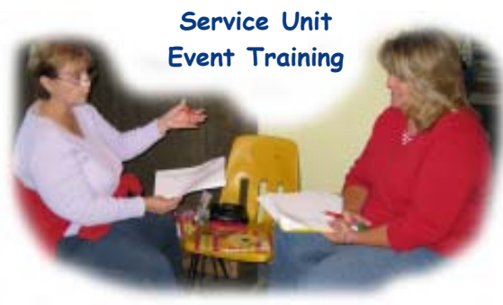
Service Unit Event Training