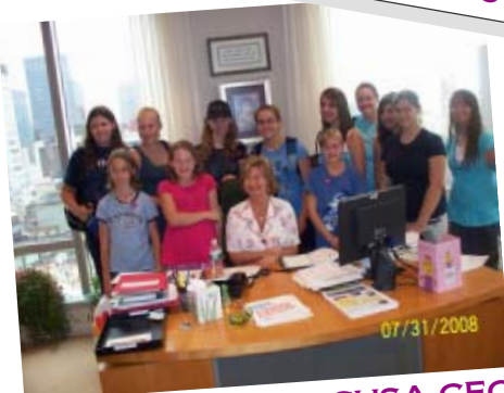
TROOP 508 WITH GSUSA CEO CATHY CLONINGER

FOR MORE GIRL SCOUT FUN, CHECK OUT OUR PHOTO SCRAPBOOK ON OUR WEB SITE —