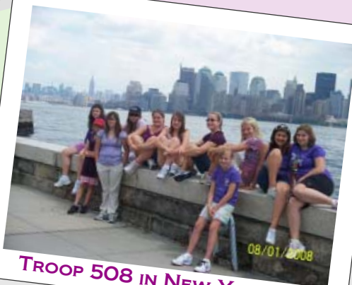
TROOP 508 IN NEW YORK CITY