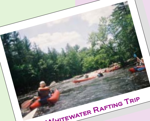
WHITEWATER RAFTING TRIP