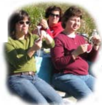
Basic Outdoor Skills