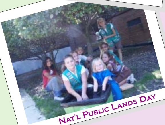
NAT'L PUBLIC LANDS DAY