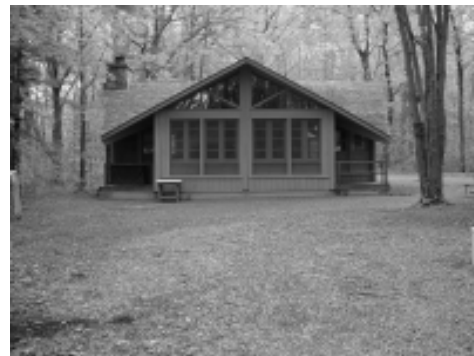
Pongay Unit House at Camp Pokonokah Hills

Camp Pokonokah Hills —This facility is used for Sybaquay's resident camp and is located about 45 minutes north of Eau Claire, Wisconsin. The camp is situated on 475 acres of gently-rolling hills and secluded lakes.